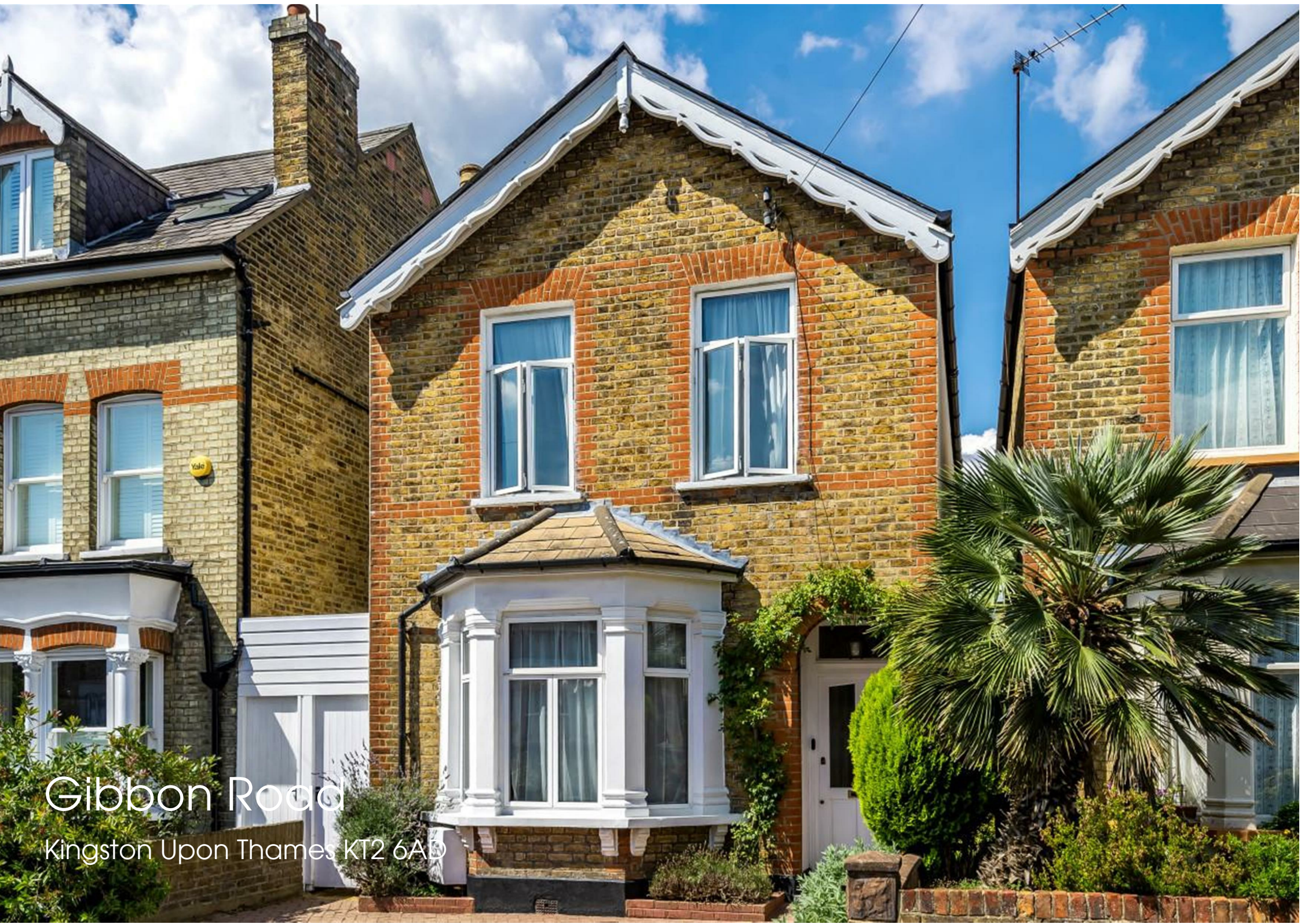
Gibbon Road Kingston Upon Thames KT2 6AB